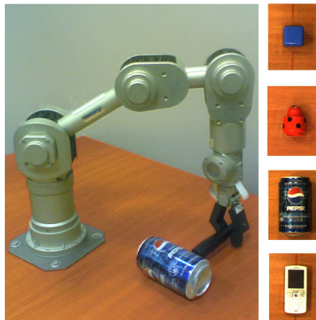
Figure 2: View of the workspace. The robotic arm holds a black plastic tool that is used to push objects on the work surface. Some sample objects are also shown.

the problem. Robotic systems have been developed to learn pre-specified binary affordance classes, e.g. rolling versus non-rolling objects (Fitzpatrick et al., 2003) or liftable versus non-liftable objects (Paletta et al., 2007). While such systems take on the difficult challenge of learning affordances in the real world, they would benefit from a more generalized form of learning that can discover affordance classes in the environment dynamically. Others (Cos-Aguilera et al., 2004) have used